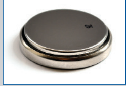
Battery CR 2450: Article-No. 7-1-2100