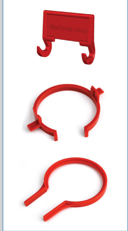
Tool-set for assembly and disassembly (collet chut, release ring, tensioner): Article-No. 7-1-4001