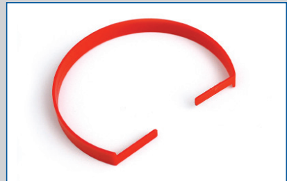
Disassembly gripper: Article-No. 7-1-4002