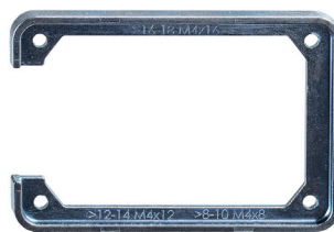
installation frame for door thickness >6 - 19,5 mm article No. 7-1-4010