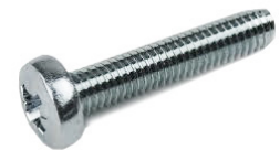
countersunk screw DIN 7985